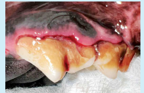
Canine Tooth Resorption - Veterinary Practice News Image