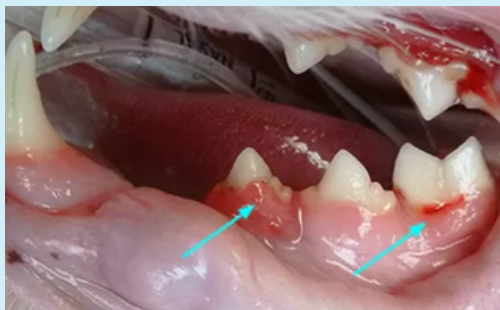
Feline Tooth Resorption - Veterinary Dental Center Image

There are both stages and grades of resorption, which are shown in this brochure. To the naked eye, resorption often looks like gingivitis growing over the tooth.